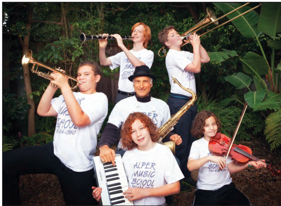
Alper Music School campers learn the language of jazz.

"Music is a language. We learn language by immersion; school comes later," Alper said. "We need to hear and experience communication first. We explore making connections between familiar experiences with the various aspects of music so that it's not abstract or detached from experience. There are more important aspects beyond