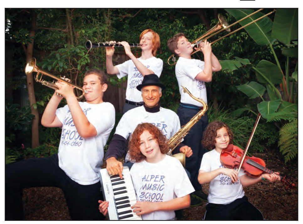
Alper Music School campers learn the language of jazz.

"Music is a language. We learn language by immersion; school comes later," Alper said. "We need to hear and experience communication first. We explore making connections between familiar experiences with the various aspects of music so that it's not abstract or detached from experience.