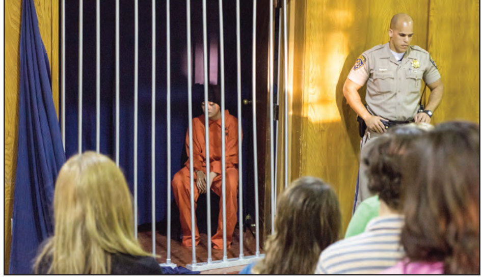
During the drug prevention program, an arrest and prison experience are highlighted.